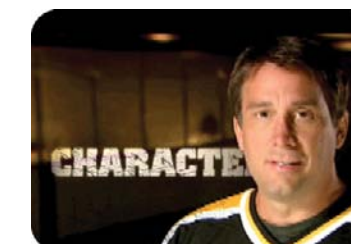
Cam Neeley: Character...this is The Hub of Hockey.