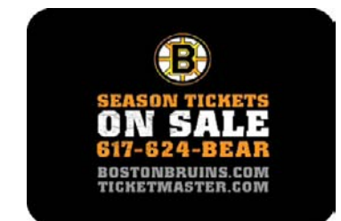
Ticket Sales Donut