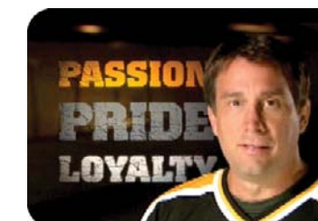
Open with music track panning camera Cam Neeley: Passion. Pride. Loyalty